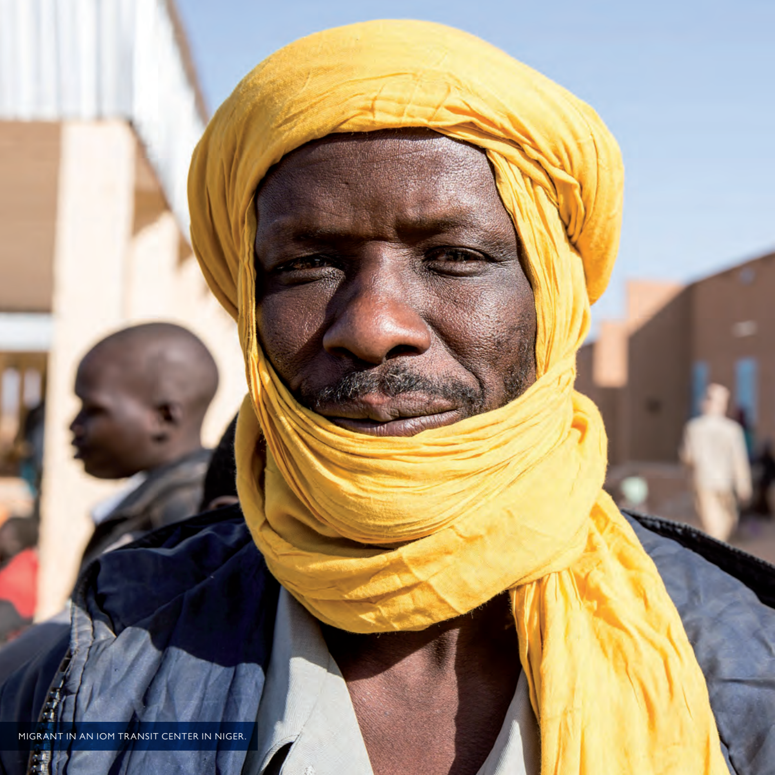
MIGRANT IN AN IOM TRANSIT CENTER IN NIGER.